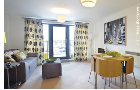
Prism House showhome

The second floor of King House comprises 12 apartments, some with balconies overlooking the open central raised courtyard.