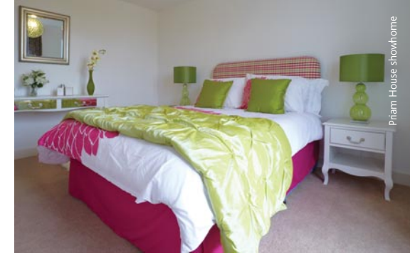
Prism House showhome