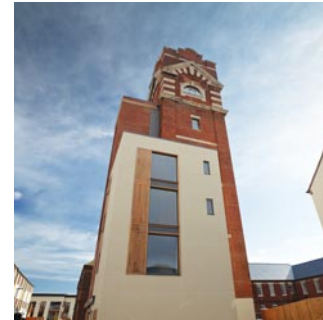
The impressive Water Tower exterior.